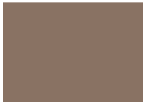
U27 Mocha Brown