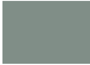
U35 Shadow Slate