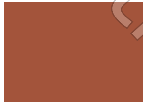
U33 Hampshire Red