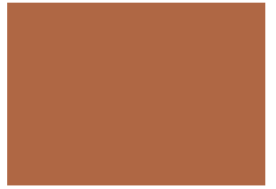
U31 Weathered Terra Cotta