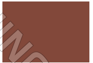
U34 Brick Red