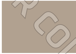
U22 Salt Marsh Gray