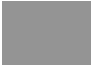
U18 Gull Gray