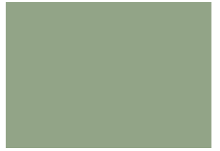
U51 Clary Sage