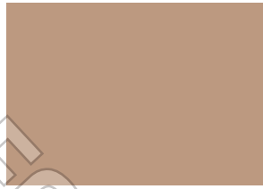
U12 Sunset Beige